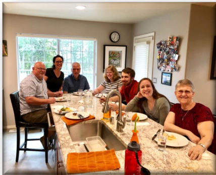
TABLE for 8 - Kick-off September 5 & 8th

"Tables of 8" are hosted by an individual in their home. The host provides a meal for about eight people. The purpose is to meet, connect and get to know one another. Clear Water Church plans to do this event over the next couple of months.