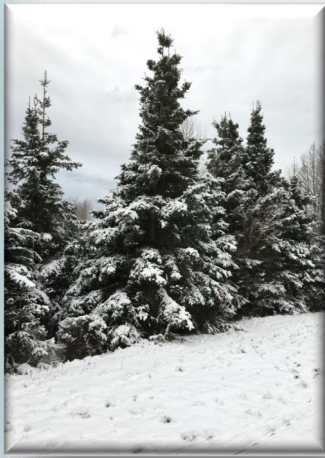
The Tree Before.....