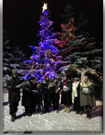
The Tree after with carollers.